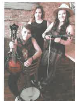
Georgia Rae Family Band

Fitzgerald's Genoa Junction, Scotty's Hot Dogs, and beer and wine will be available for purchase. Visit www.rlbccivcenter.com to pre-purchase meal tickets through Eventbrite. Pre-purchased meals are guaranteed; same day orders will be limited.